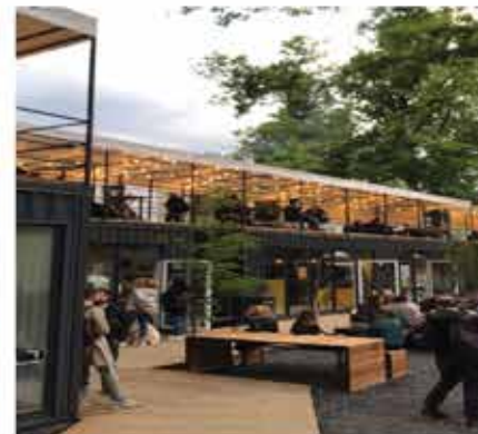
Restaurant & Cafe