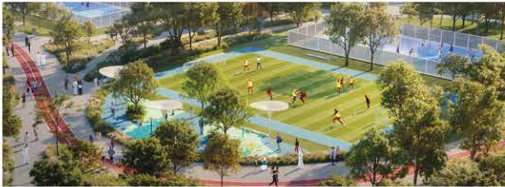
Sport & Recreation

Baniyas Heritage Park has been conceived as a cultural and recreational landmark that brings people together in a setting where heritage and modern design coexist seamlessly. At its heart, the park creates spaces for gathering, celebrating, and connecting, while offering visitors a green escape rooted in Abu Dhabi's identity.