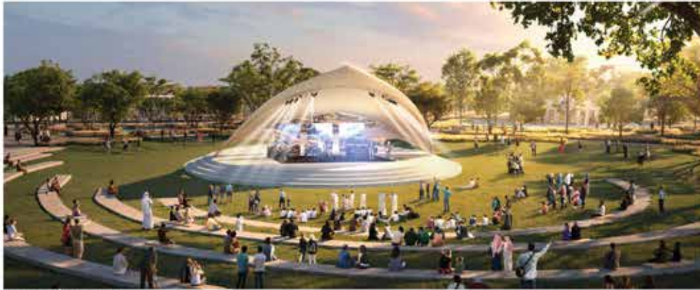
Stage & Lawn