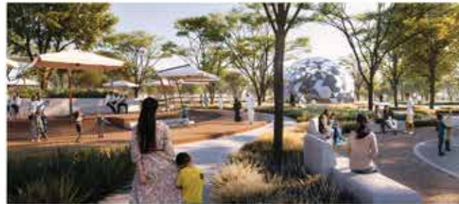
Trampo Seating Area