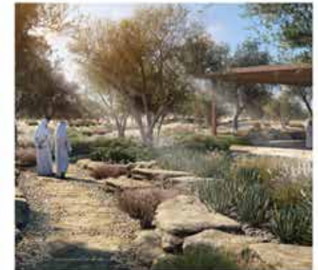
Running & Walking Track