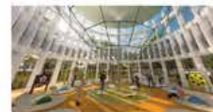
Playground & Fitness

For those seeking leisure with comfort, luxury glamping tents provide a refined retreat within the park, blending modern amenities with an authentic natural backdrop. These facilities expand the park's offering beyond daytime recreation, inviting visitors to enjoy overnight stays that immerse them in both cultural heritage and contemporary outdoor living.