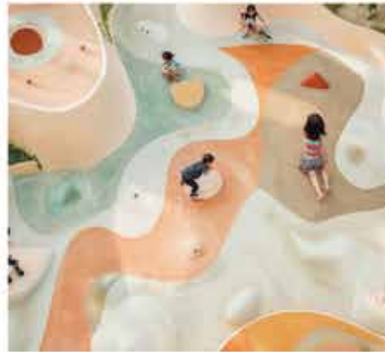
Kid's and Toddler's Play areas

Social spaces and facilities establish the park as a true community hub. From bustling marketplaces and cafés to welcoming petting experiences, every element is designed to foster connection, hospitality, and cultural exchange. Together, they create a setting that is not only recreational, but also enriching — a place where people gather, share, and celebrate life.