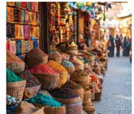
Grand Soul Bazaar