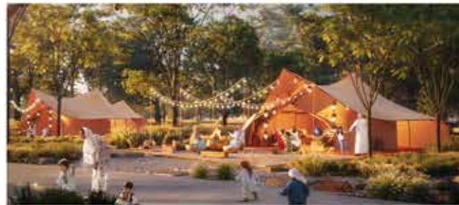
Luxuri Glamping Tents