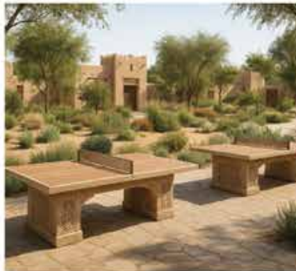
Casual Sports Zone