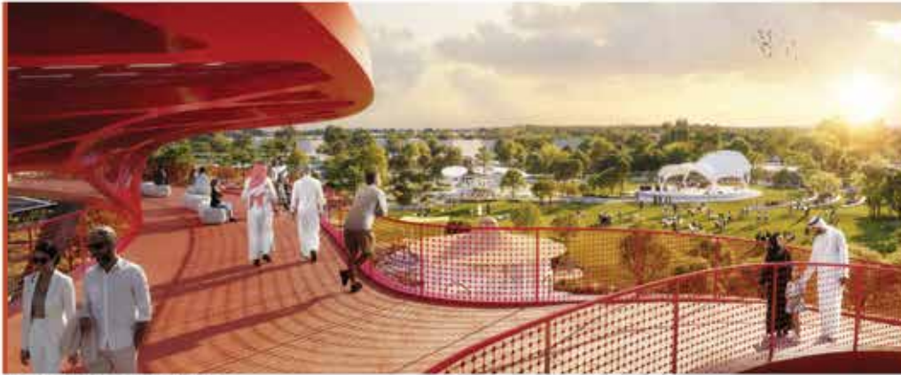
Sunset from the Ring