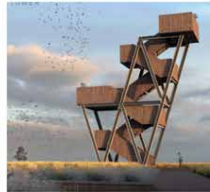
Falcon's View Zipline