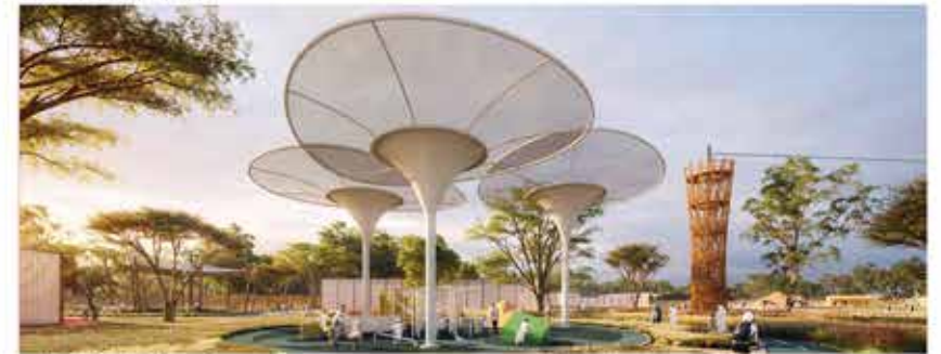
Toddler Play Area

Catering to younger visitors, the Toddler Play Area creates a safe and engaging space where children can explore, play, and learn. Designed with shaded structures, imaginative play equipment, and soft landscaping, it provides families with a dedicated zone that encourages physical activity, creativity, and social interaction.