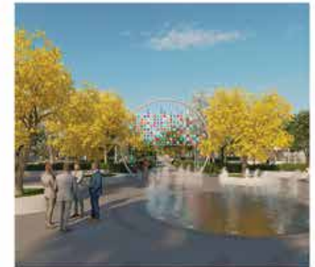
Dry Deck Fountain