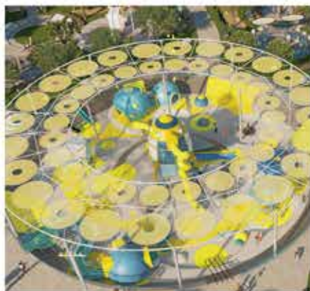
Moon Crater Play