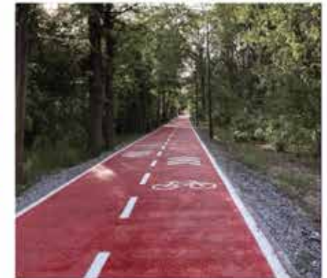
Running & Walking Track