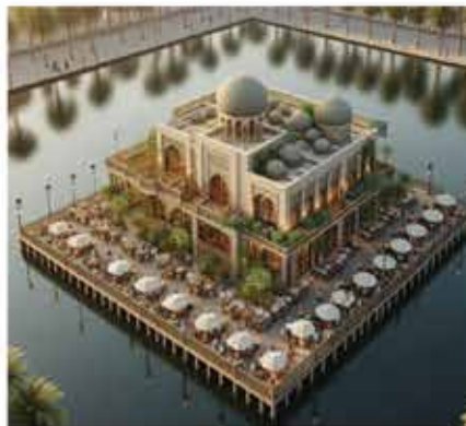
Floating Palace Restaurant