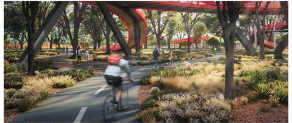
Bike & Forest Tracks

Meandering through shaded groves, the bike and walking tracks invite exploration and movement while maintaining harmony with the desert setting. Designed for leisure and wellbeing, they create opportunities for both active recreation and quiet immersion in nature. The open-air stage provides a dynamic space for performances, cultural programs, and community gatherings. Surrounded by landscaped seating and shaded lawns, it establishes the park as