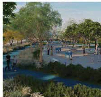
Fitness Station Changing