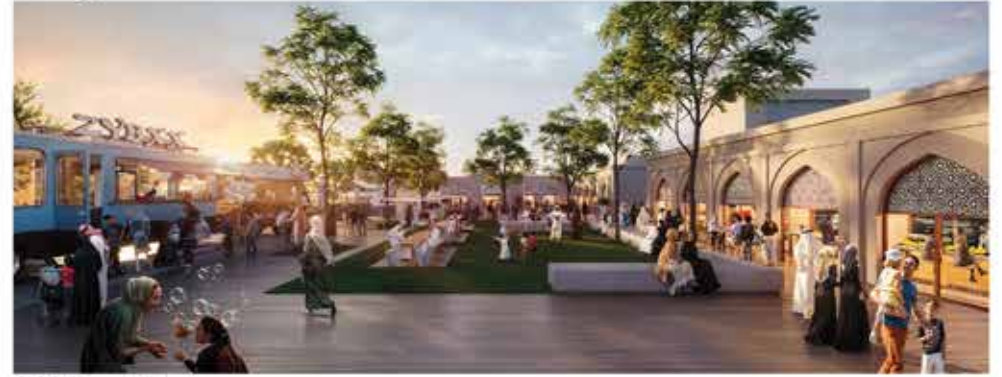
F&B Food Trucks

play zones. These areas are thoughtfully integrated with walkways and landscapes, encouraging health, wellness, and engagement for all age groups.