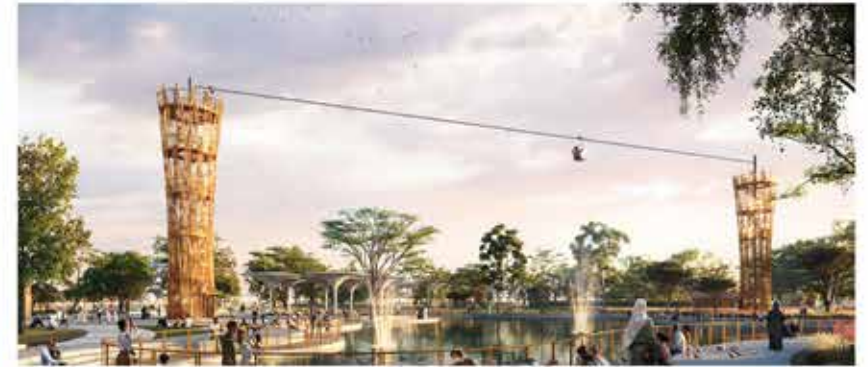
Lake & Zipline

The Lake & Zipline add an adventurous spirit to the park, combining natural beauty with dynamic recreation. Visitors can enjoy the serene ambiance of the water while engaging in thrilling zipline rides that glide across the lake, offering panoramic views of the park's lush greenery and circular landscape design. This feature symbolizes the balance of calm and excitement, encouraging both leisure and activity within a sustainable, thoughtfully designed environment.